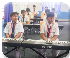
Introducing Music classes to foster student bands by professional music platform – Torrins Anthem Pvt. Ltd. (Guitar, Synthesizer, and Ukulele)