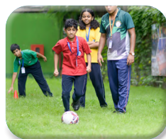
Professional coaching in Roller skating, Taekwondo, Football, Basketball, and Indoor Sports