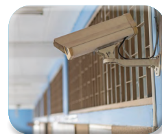
24x7 CCTV surveillance for comprehensive campus security