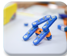
Advanced STEAM Lab for AI, Robotics, and integrated STEAM Learning