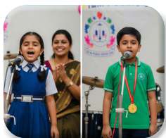
Public Speaking – Builds confidence and communication.