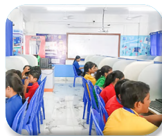
EI Cares, EI Asset & EI MindSpark – Smart tools & designated lab for skill-based learning.