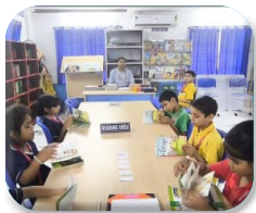
Learning Resource Centre Laboratory for All Subjects