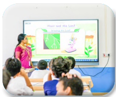
Tech enabled spacious smart classrooms