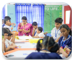
Online Simulation lab