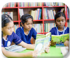
Extensive library with a wide range of books