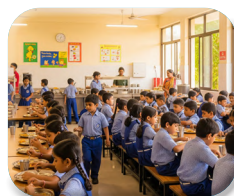
Hygienic and comfortable cafeteria offering healthy refreshments