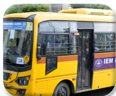
GPS-enabled school bus facility for safe and efficient transportation