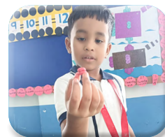
Curriculum following NEP 2020