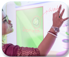
Smart Interactive Digital Board - Touch-enabled Digital Learning screens