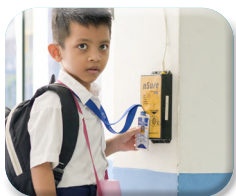
RFID-enabled ID cards for secure and monitored access