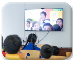
Audio Visual Room – Interactive learning through media.