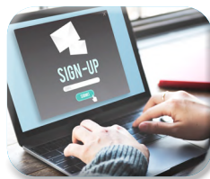
Unique email ID with school domain name