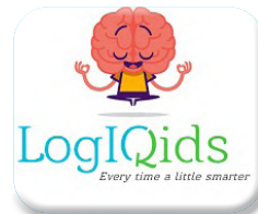
LogIQids – Boosts logical thinking and logical reasoning in students