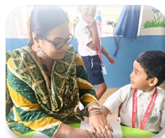
Experienced, compassionate, and DIKSHA-certified teaching staff