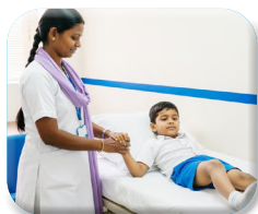
Infirmary with an on-call doctor and a dedicated nurse for first aid and medical care