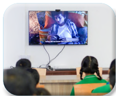
School Cinema - value based a life-skills and social-emotional learning curriculum